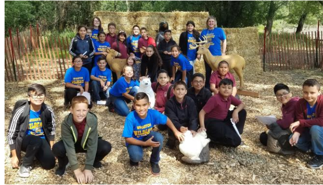
"A River Thru History" 4 years

We have taken the time to research period correct archery equipment for juried events. Our longbows are in the 20# draw range so even young history fans are safe to shoot! Our hand-crafted arrows are made of Port Orford Cedar, with self nocks and sinew wrapped turkey feathers!