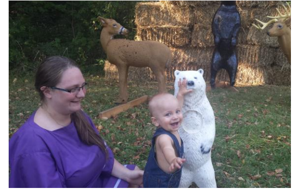
Boone Co. "Autumn Pioneer Days"