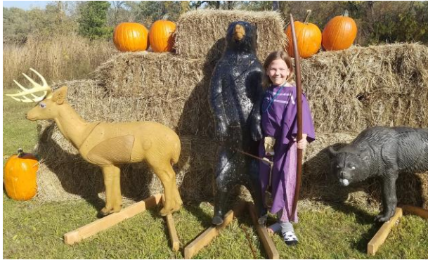
"Macktown Gathering" 5 years